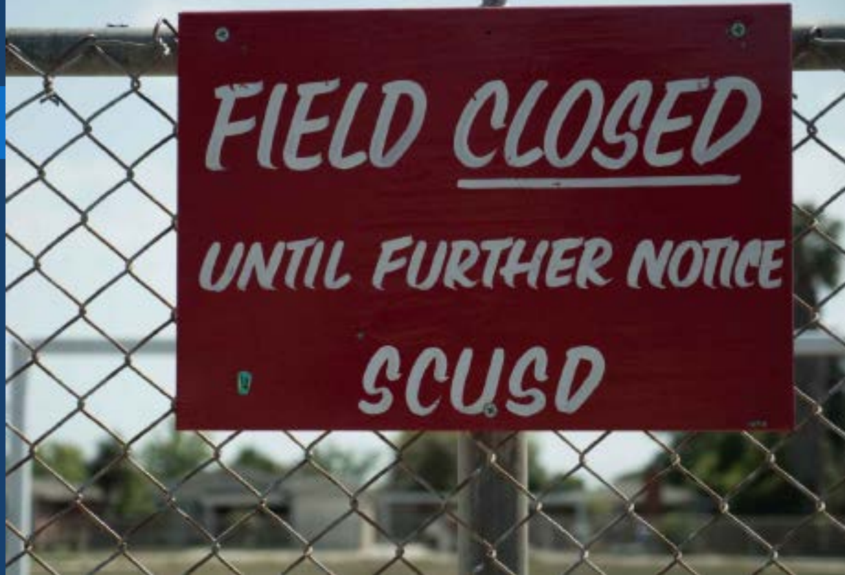
Closure of Maple Elementary School